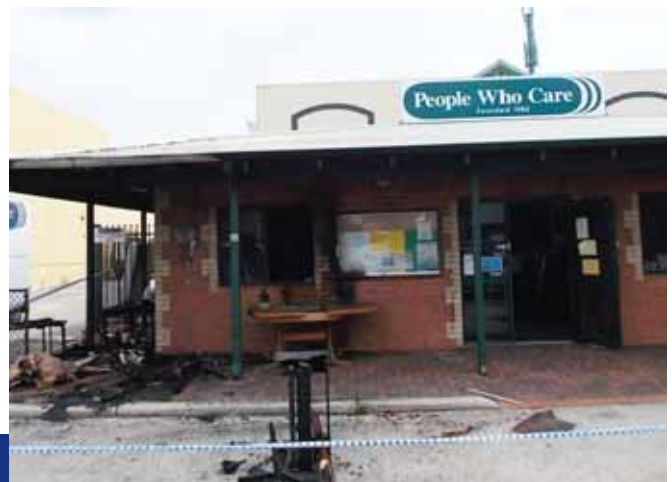
The fire damaged front of the PWC Guildford Office

As the Shop is PWC's main fundraiser we will be in need of bric-a-brac, furniture and clothes in around two months time. If you are having a spring clean, please keep PWC in mind.