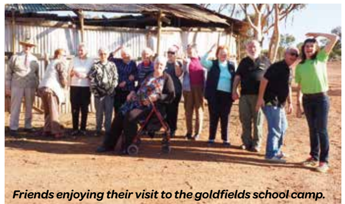
Friends enjoying their visit to the goldfields school camp.